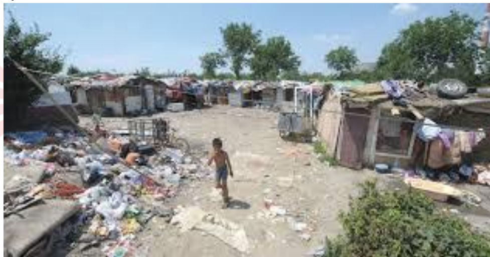
Spatial and social segregation